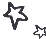
Tableau: a frozen picture